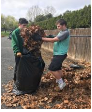
Youth At Work

Looking ahead:..... HOPE - Pacific N.W. Women Ministries Fall Retreat September 21 - 23, 2018