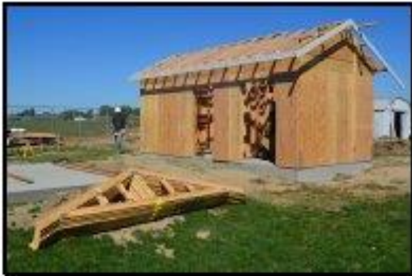
The Maintenance Building that will house the generator and all of the electrical equipment for the cell towers.