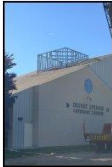
The bottom framework for the "room" that will house the cell towers.