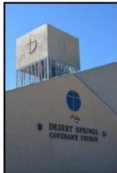
"Room" raised in place.