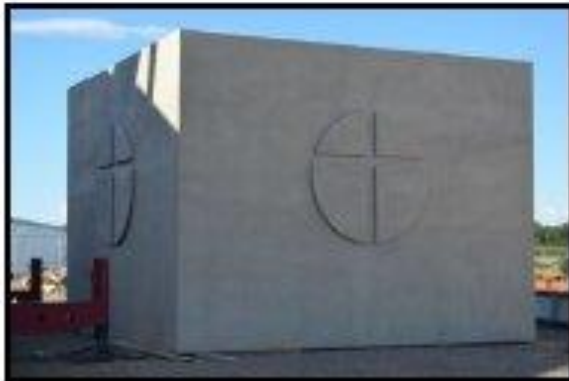
The "room" that will house the cell towers.

Close-up of the bas relief that is on all four sides of the cell tower. It matches the bas relief over the north exit door of the church and matches the circular windows w/the cross on the front and the back of our building.